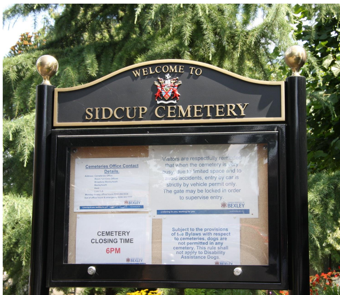
Sidcup Cemetery

There are 28 Commonwealth War Graves located here – 7 relating to World War 1 & 21 relating to World War 2.